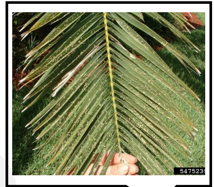
Dust mites in date palm